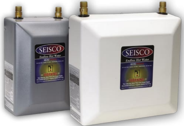
Two & Four Chamber Models Shown

Thermistor Temperature Sensing -Five thermistors continuously monitor inlet/outlet water temperature and the water temperature in each heating element chamber. Outlet water temperature is factory set to 120°F and is field adjustable between 90-145°F. In addition, water flow is sensed using the same thermistors, eliminating the need for troublesome flow switches.