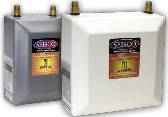
Two & Four Chamber Models Shown

Thermistor Temperature Sensing -Five thermistors to continuously monitor inlet/outlet water temperature and the temperature in each heating element chamber.